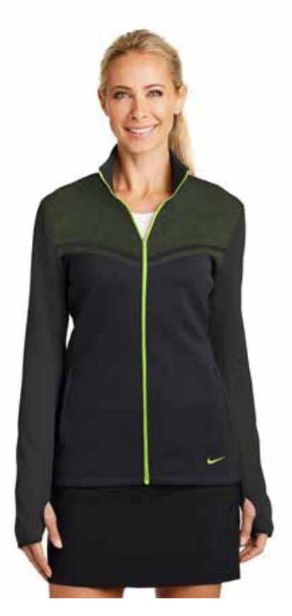
Green - Only XS, S, M available